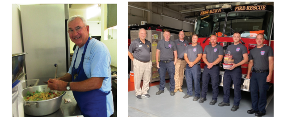
RCS lunches - 1 st Fridays