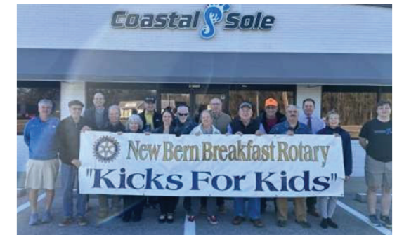
Kicks-4-Kids Program with Craven County schools