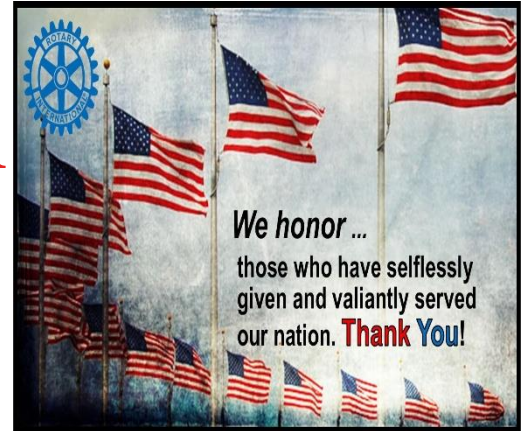
Memorial Day – May 25, 2026