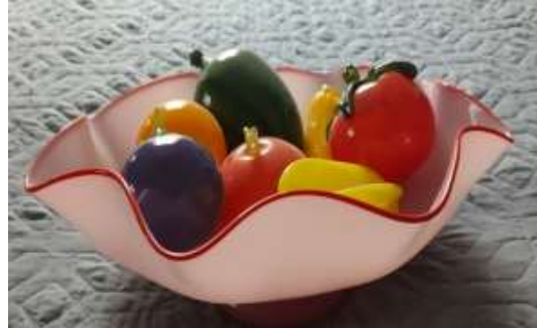
Hand-Blown Glass Bowl with Fruit Pieces