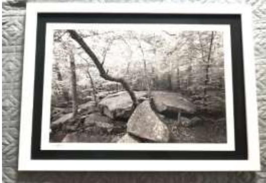
Framed B&W Photograph - 20"x 25"

Sample of art items that will be available